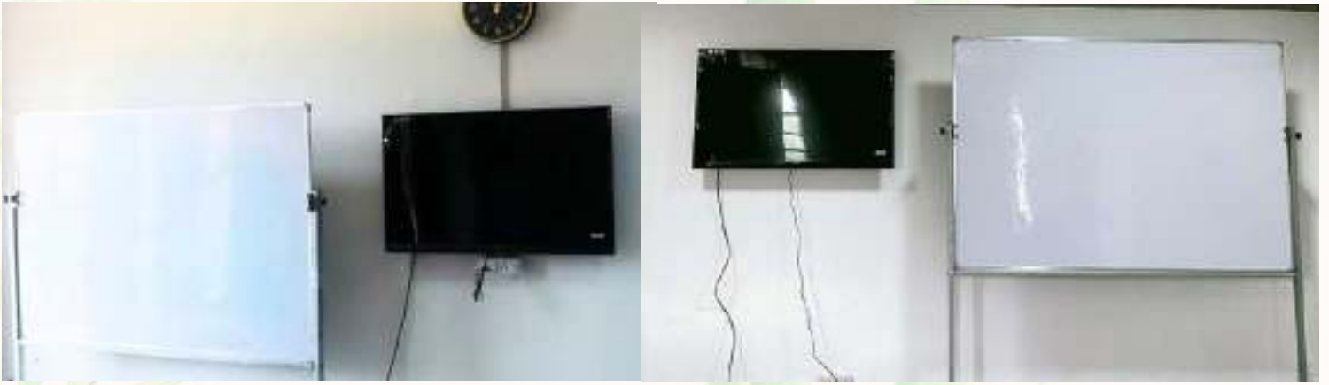
Renovated Lecture halls with LCD Screens