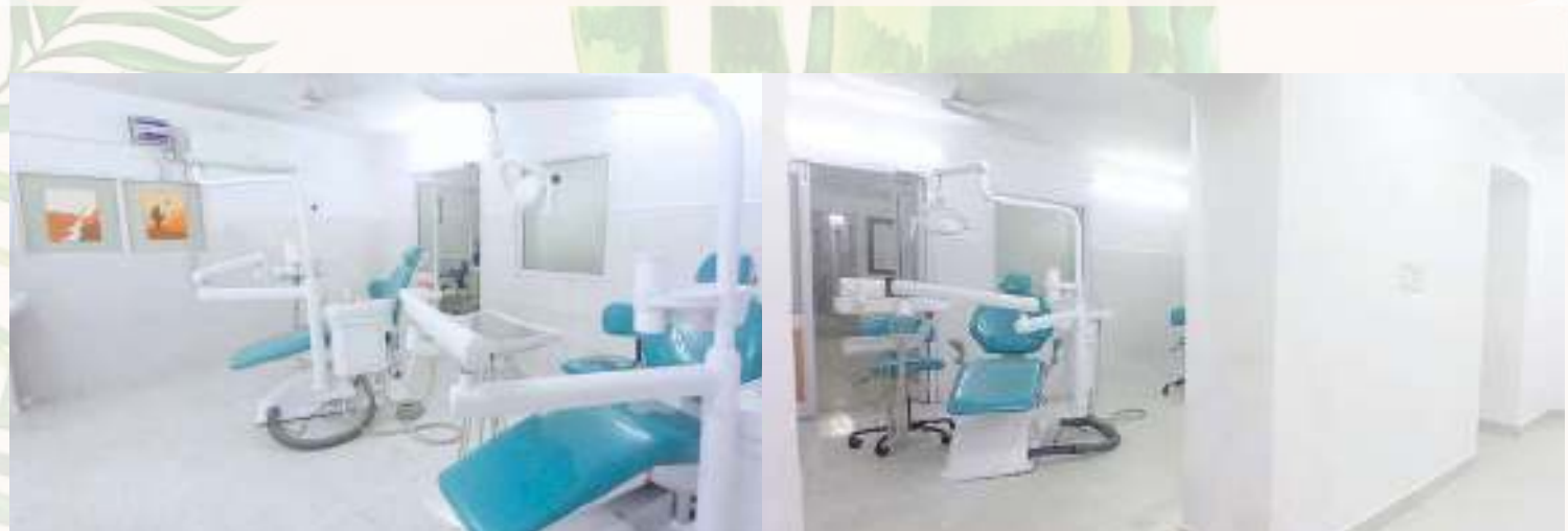
Renovated Implant Section in Department of Prosthodontics