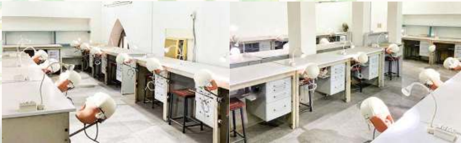
New Phantom Head Lab